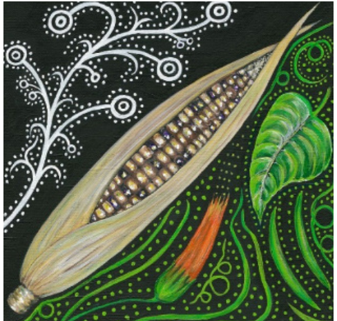
Rotinonhsyón:ni Representation of Integrity