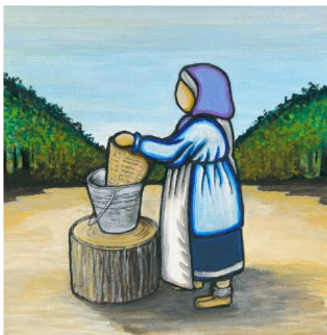
Rotinonhsyón:ni Representation of Care