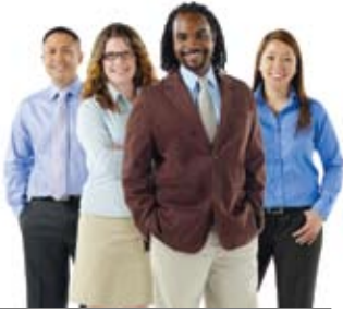
Ontario teachers – like other professionals – now have a professional designation they can use. It's a first for Canadian teachers and a new mark of professionalism.

OCT is an appropriate description of you as an individual certified teacher and as a member of the collective of Ontario's teachers