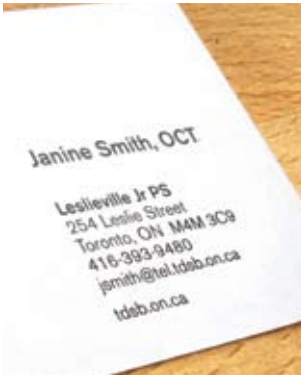
Use the OCT designation after your name on your card.