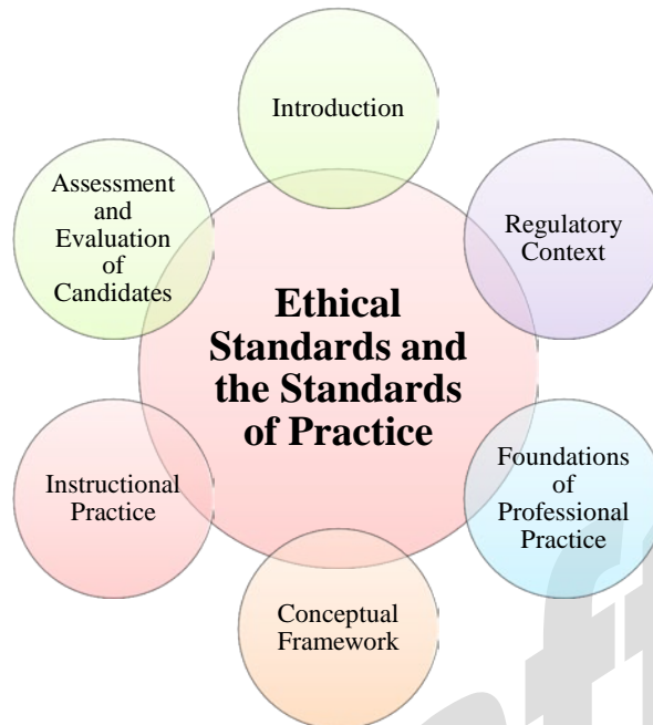
Diagram 1: Guideline Organization

The guideline for Teaching Green Industries – Horticulture Management Science is organized using the following framework.