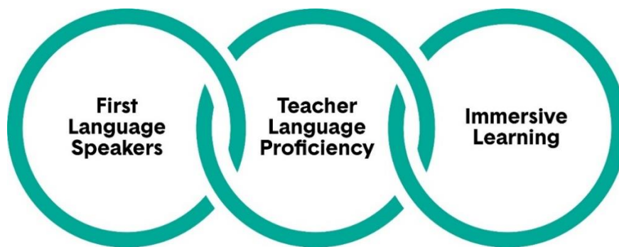
Figure 1: Important Context for the Development and Delivery of AQ Course

Stabilize language-loss to recover Haudenosaunee languages, which are believed by the Haudenosaunee to have been given to them by the Creator, is central to sustaining Haudenosaunee civilizations. Grounded in Haudenosaunee values and cultural knowledge – which is also inherent in the languages – Onondaga remains deeply rooted in Haudenosaunee history, territories, ceremonies, cultural practices, and way of life, which have transcended colonialism, including the residential school era. With this in mind, the following are included as additional considerations for the development and delivery of the AQ Course: Teaching Onondaga, Part I (Figure 1 and 2):