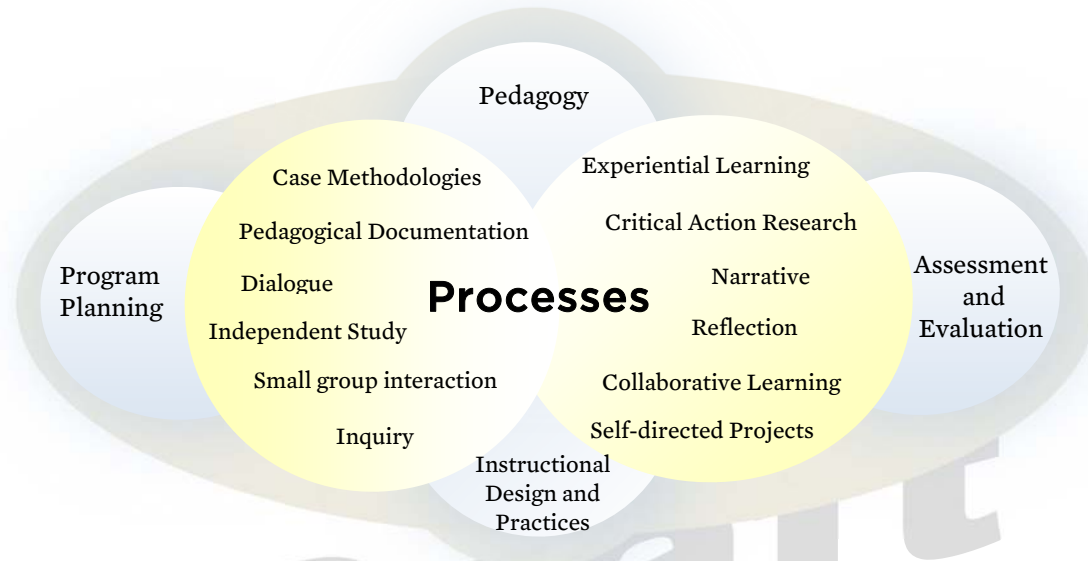
Figure 5: Instructional Processes

projects, independent study, small group interaction, dialogue, action research, inquiry, pedagogical documentation, collaborative learning, narrative, case methodologies and critical reflective praxis.