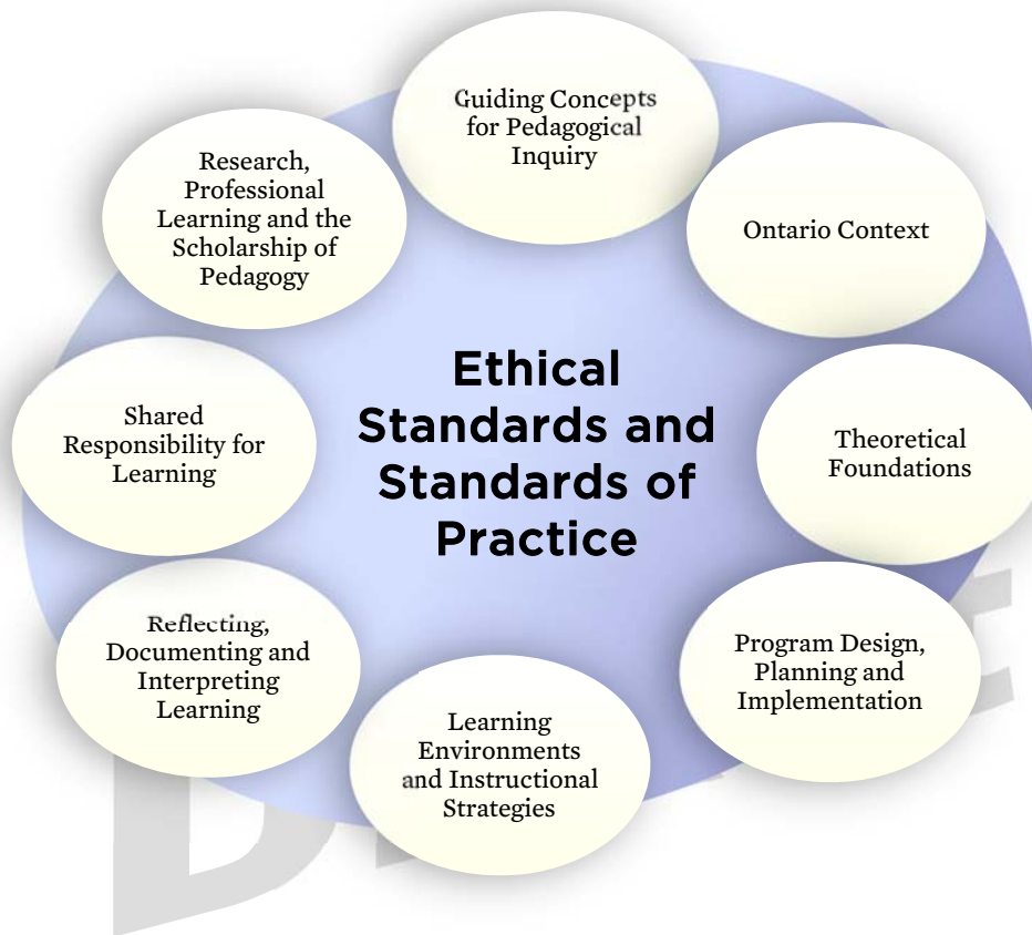
Figure 4: Pedagogical Inquiry Framework for Family Studies, Part I