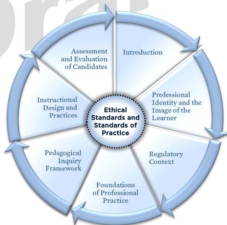
Figure 1: Conceptual Framework

The Additional Qualification (AQ) course guideline for Family Studies, Part I is organized using the following conceptual framework,