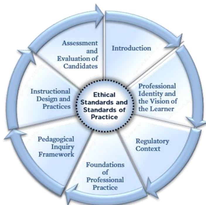
Figure 2: Conceptual Framework

The Additional Qualification Course: Education Law employs a critical, pedagogical lens to explore in a holistic and integrated manner theoretical foundations, learning theory, program planning, development and implementation, instructional design and practices, assessment and evaluation, the learning environment, research and ethical considerations related to teaching and learning within and across the divisions. Through these explorations, candidates strengthen professional efficacy by gaining in-depth knowledge, refining professional judgment and generating new knowledge for practice.