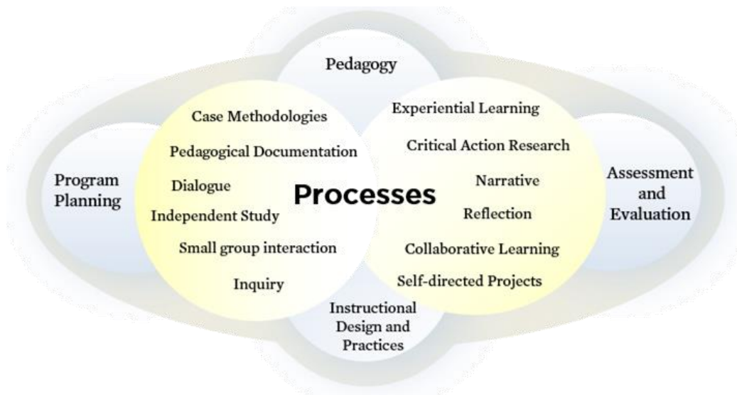
Figure 6: Instructional Processes

Instructors embody the Ethical Standards for the Teaching Profession and the Standards of Practice for the Teaching Profession , honour the principles of adult learning, respect candidates' experience, recognize prior learning, integrate culturally inclusive practices and respond to individual inquiries, interests and needs. Important to the course are opportunities for candidates to create support networks, receive feedback from colleagues and instructors and share their learning with others. Opportunities for professional reading, reflection, dialogue and expression are also integral parts of the course.