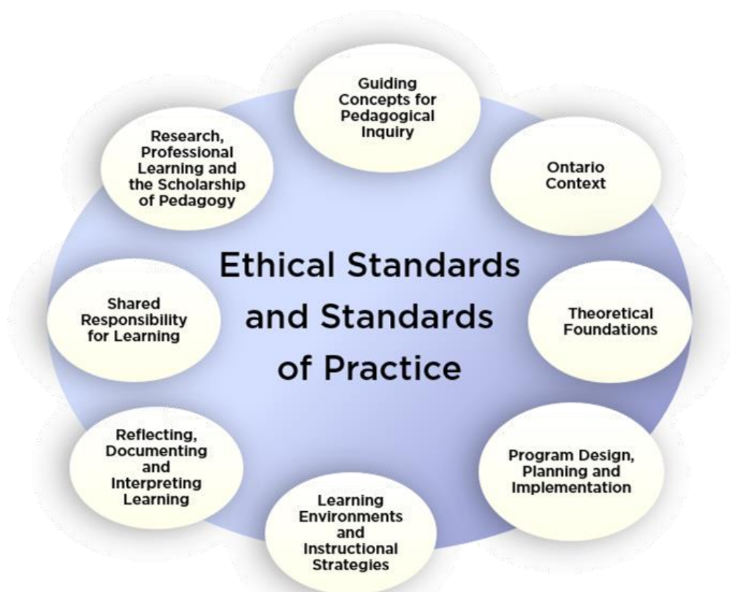
Figure 5: Pedagogical Inquiry Framework for Education Law