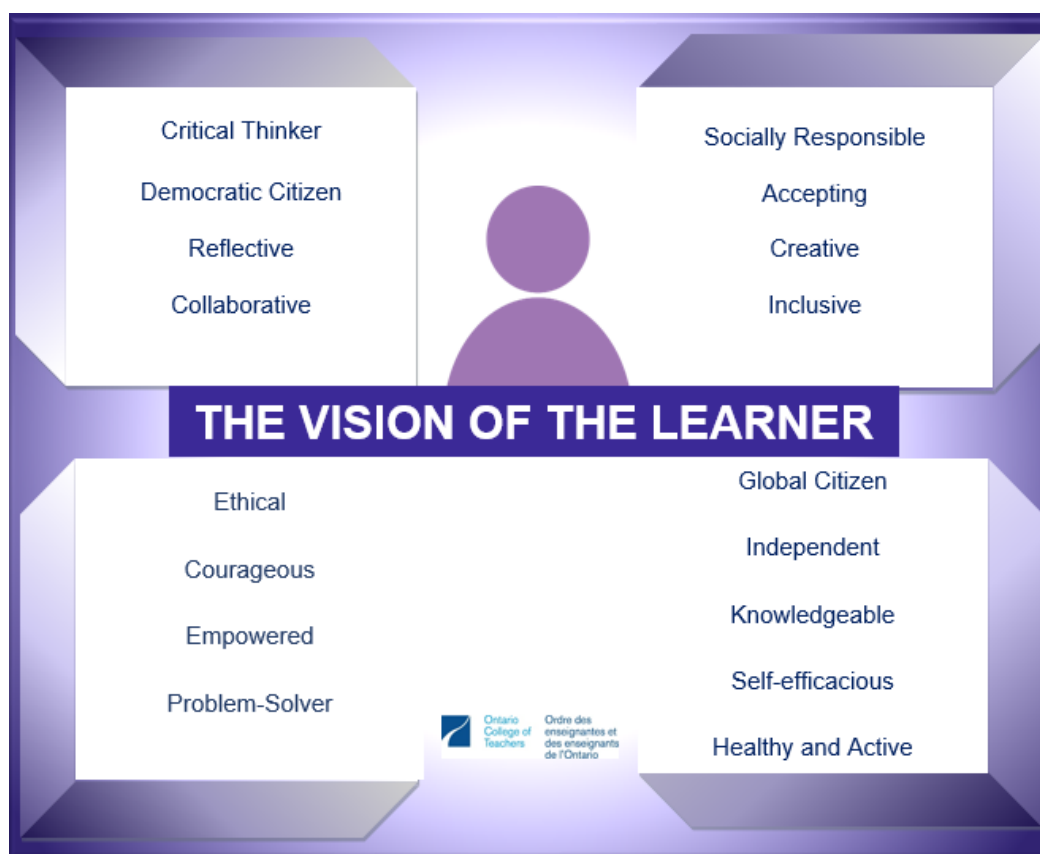
Figure 4: Vision of the Learner