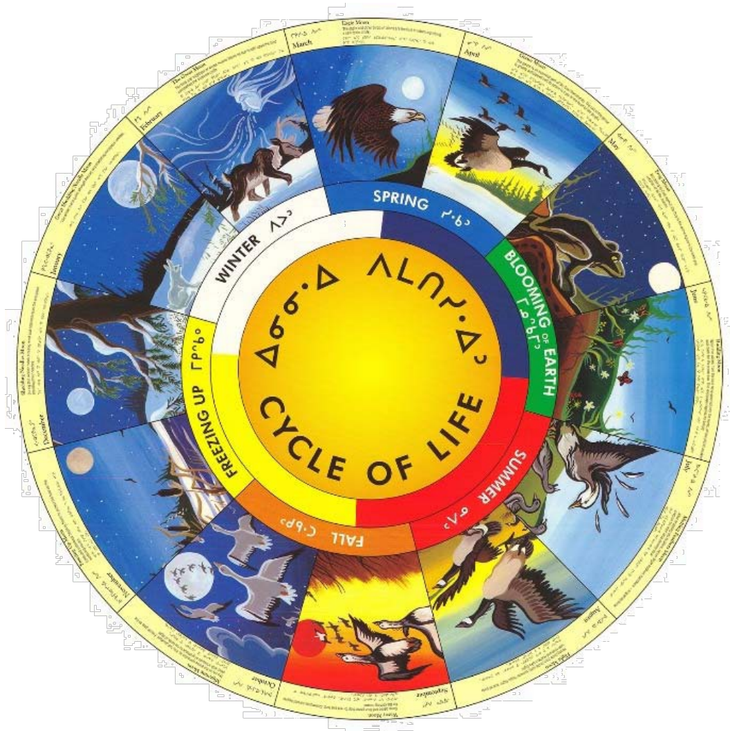
Figure 1: Cycle of Life

Image used by permission from Omushkego Education – Mushkegowuk Council