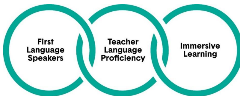
Figure 1: Important Context for the Development and Delivery of AQ Course

Stabilize language-loss to recover Haudenosaunee languages, which are believed by the Haudenosaunee to have been given to them by the Creator, is central to sustaining Haudenosaunee civilizations. Grounded in Haudenosaunee values and cultural knowledge – which is also inherent in the languages – Onondaga remains deeply rooted in Haudenosaunee history, territories, ceremonies, cultural practices, and way of life, which have transcended colonialism, including the residential school era. With this in mind, the following are included as additional considerations for the development and delivery of the AQ Course: Intermediate Division Teaching Onondaga (Figure 1 and 2):