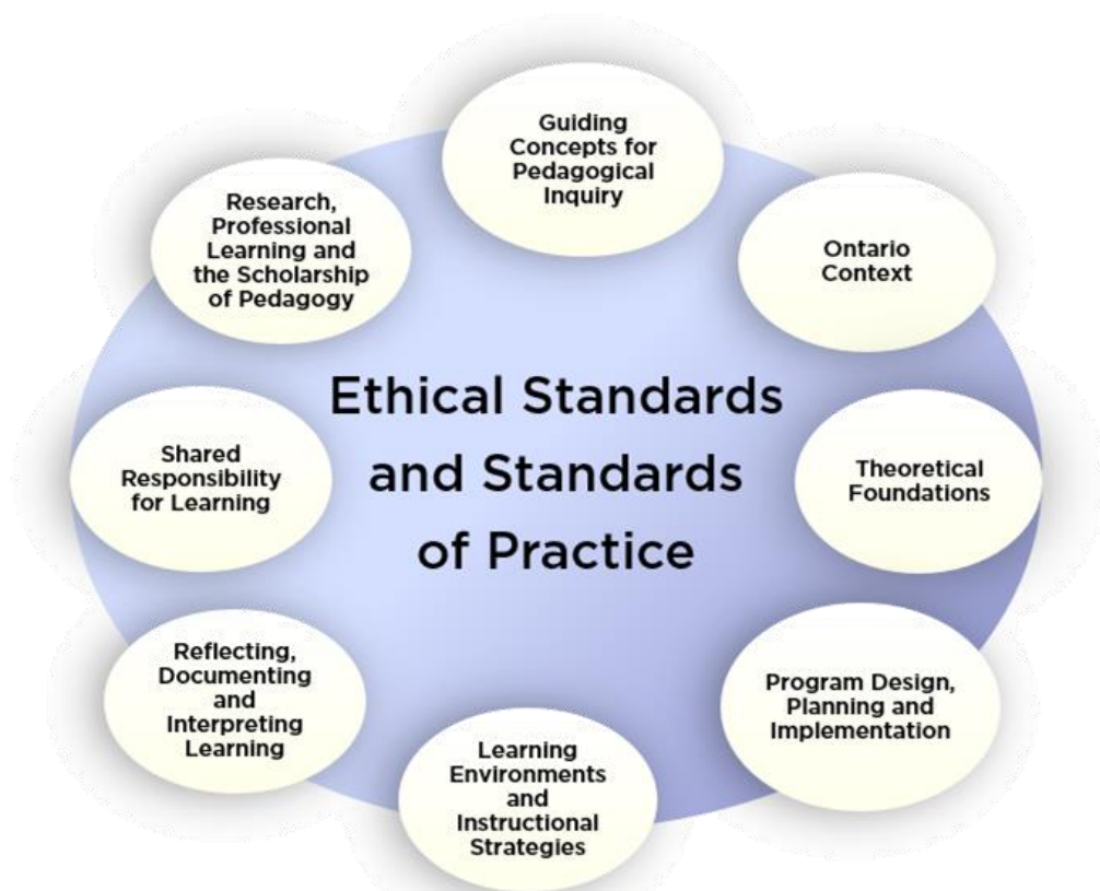
Figure 5: Pedagogical Inquiry Framework for Senior Division, Business Studies – General