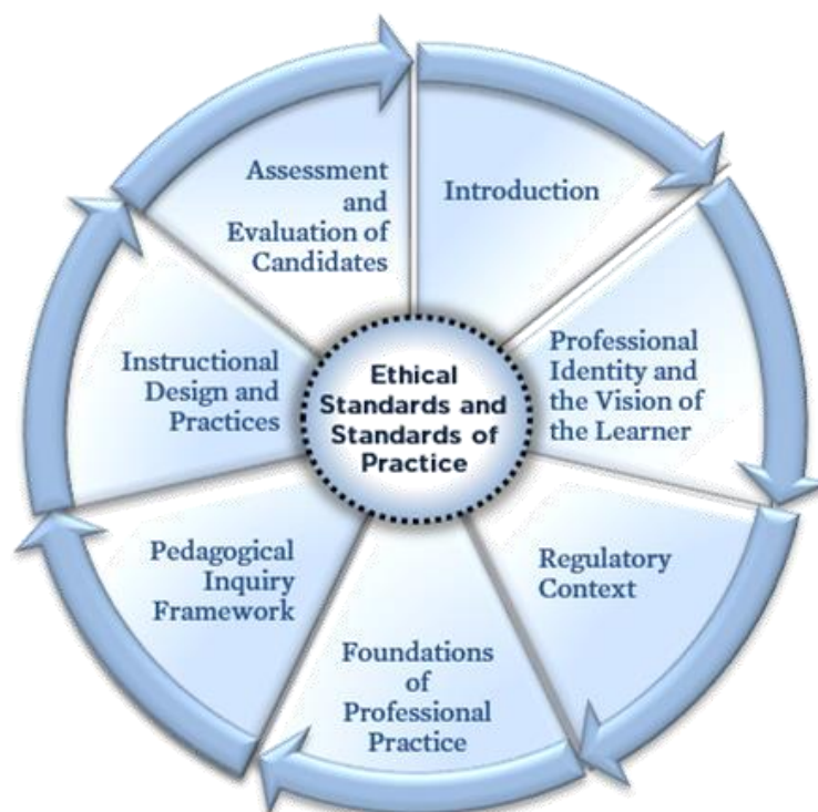
Figure 2: Conceptual Framework

Candidates come to the Additional Qualification Course: Senior Division, Business Studies – General with an interest and/or background in this area of study.