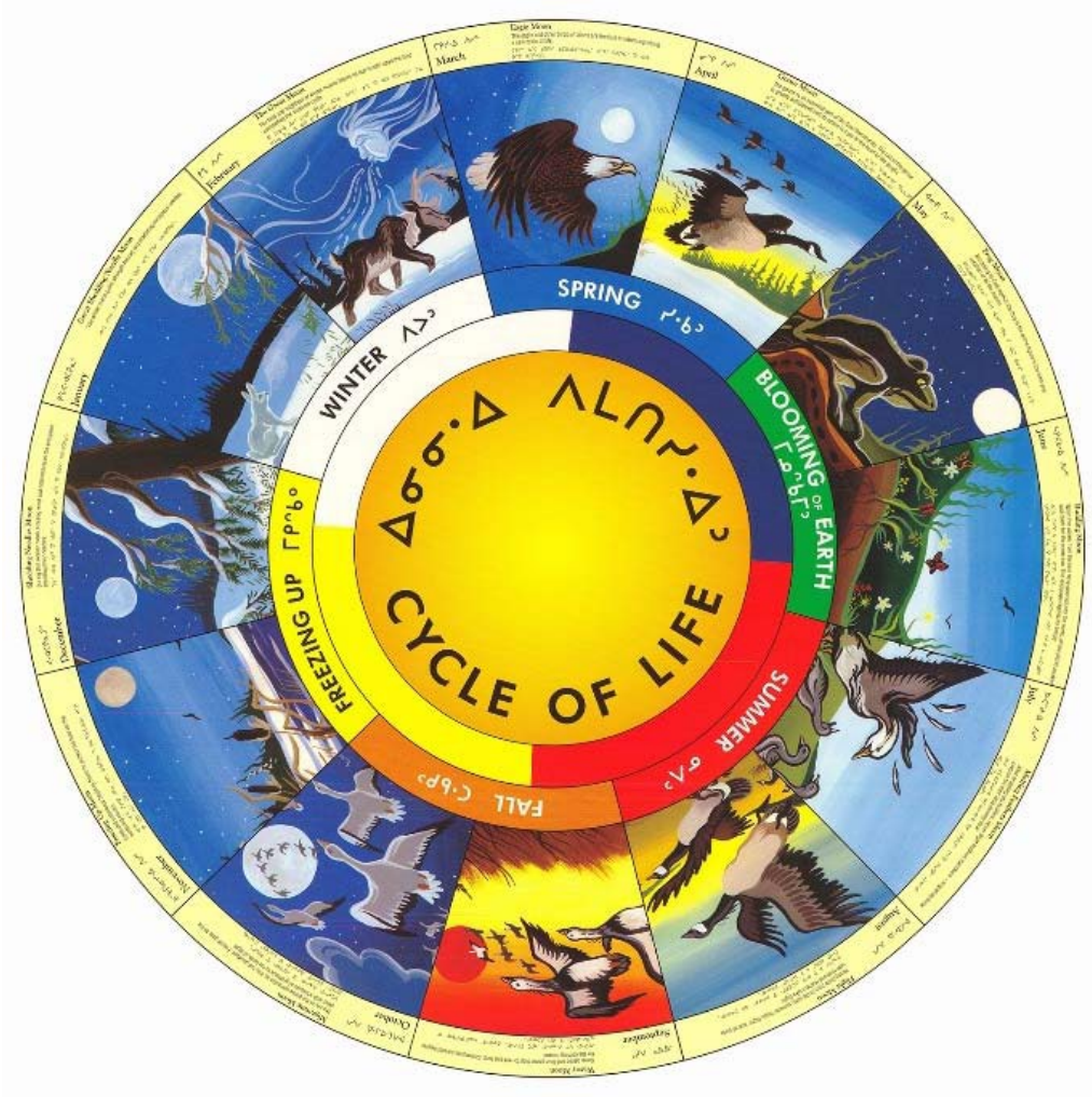
Figure 1: Cycle of Life