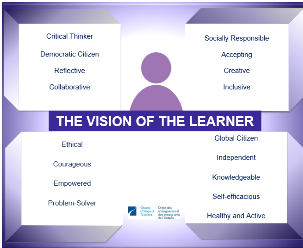
Figure 4: Vision of the Learner