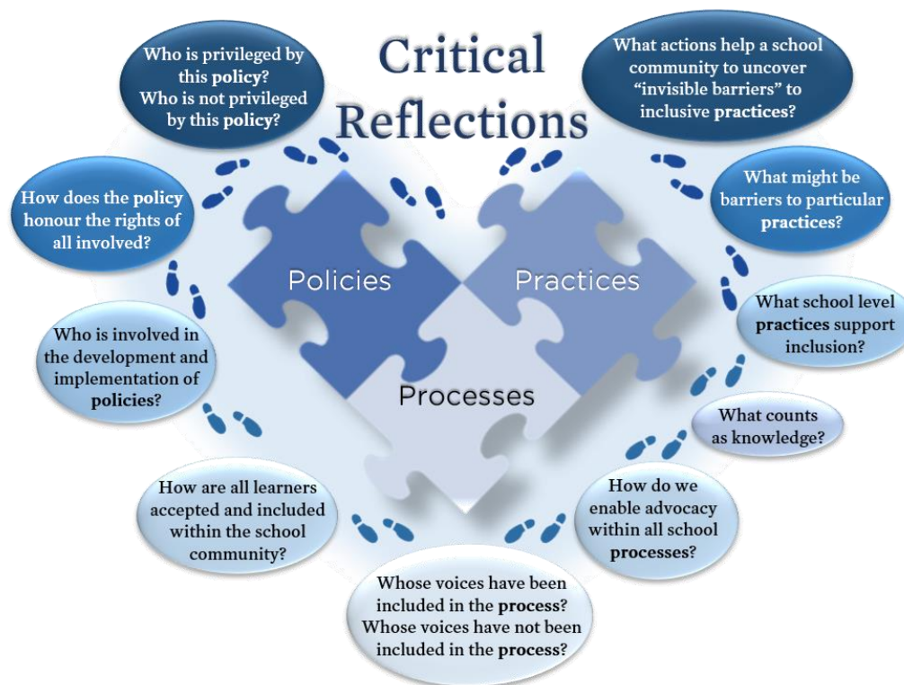
Figure 1: Critical Reflections