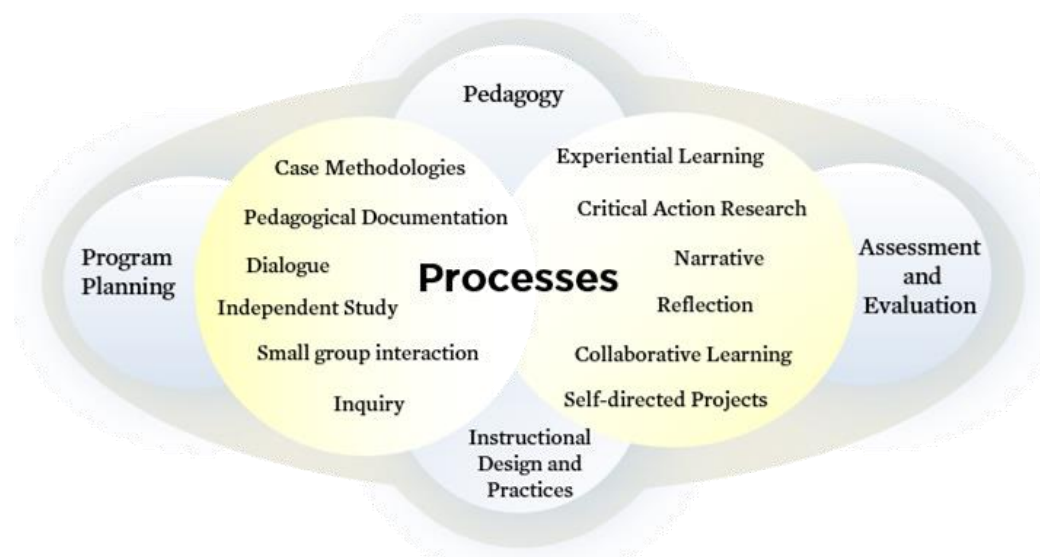
Figure 6: Instructional Processes

In the implementation of this Additional Qualification course, instructors facilitate andragogical processes that are relevant, meaningful and practical to provide candidates with inquiry-based learning experiences related to program design, planning, instruction, pedagogy, integration and assessment and evaluation. The andragogical processes include but are not limited to: experiential learning, role-play, simulations, journal writing, self-directed projects, independent study, small group interaction, dialogue, action research, inquiry, pedagogical documentation, collaborative learning, narrative, case methodologies and critical reflective praxis.