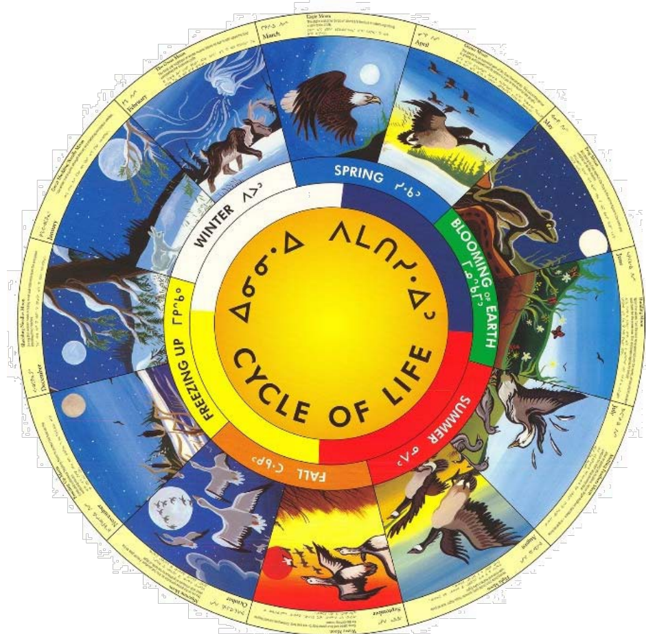
Cycle of Life

This image is described in further detail in Figure 1 of the AQ course guideline.