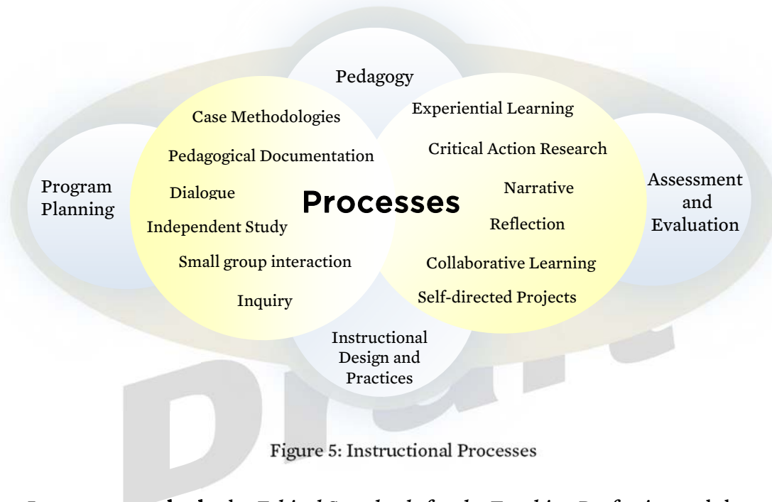
Figure 5: Instructional Processes

design, planning, instruction, pedagogy, integration and assessment and evaluation. The andragogical processes include but are not limited to experiential learning, role-play, simulations, journal writing, self-directed projects, independent study, small group interaction, dialogue, action research, inquiry, pedagogical documentation, collaborative learning, narrative, case methodologies and critical reflective praxis.