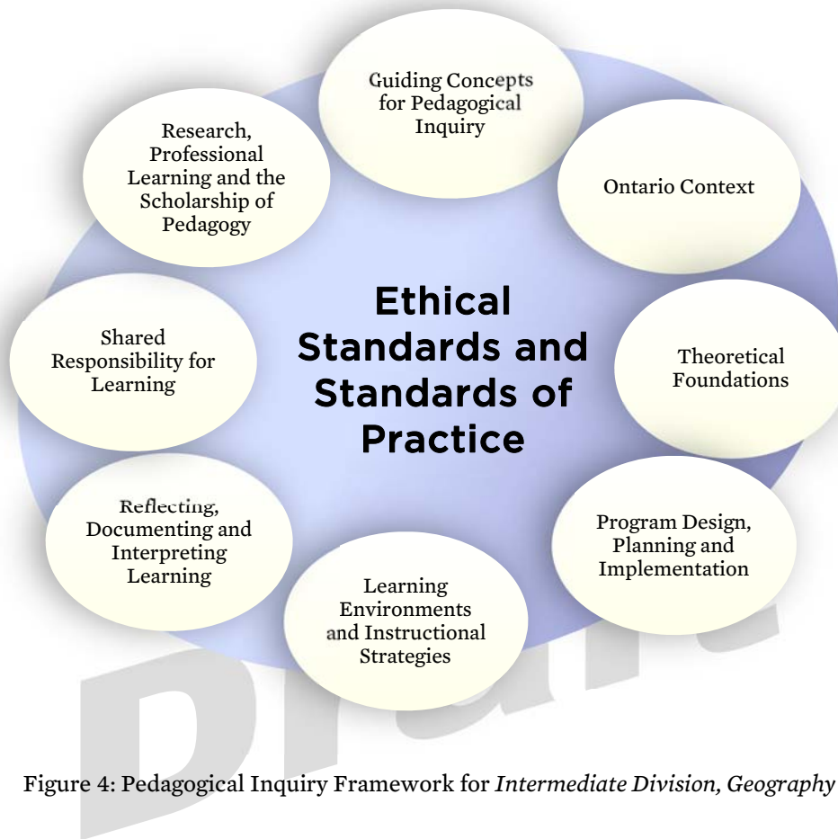
Figure 4: Pedagogical Inquiry Framework for Intermediate Division, Geography