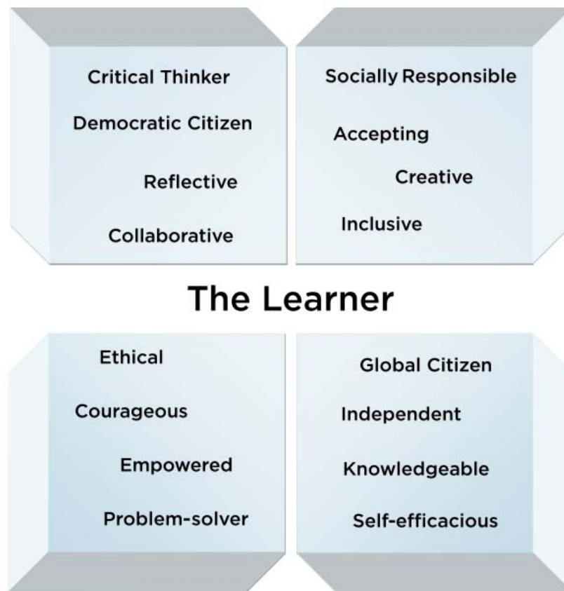
Figure 3: Vision of the Learner

The vision of the student conveyed in this AQ (Figure 3) is of a learner who is empowered, independent, a democratic citizen, knowledgeable, creative, collaborative, a critical thinker, ethical, reflective, accepting, inclusive, courageous, self-efficacious, a problem-solver, and whose voice and sense of efficacy are integral to shaping the teaching and learning process.