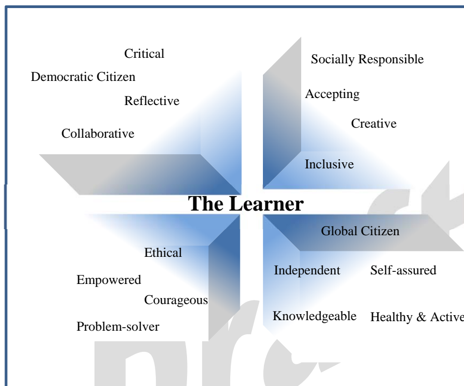
Figure 3: Image of the Learner

The image of the student conveyed in this AQ (Figure 3) is of a learner who is empowered, independent, a democratic citizen, knowledgeable, creative, collaborative, a critical thinker, ethical, reflective, accepting, inclusive, courageous, self-assured, a problem-solver and whose voice and sense of efficacy are integral to shaping the teaching and learning process.