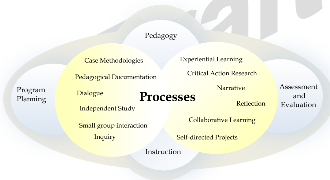
Figure 5: Instructional Processes

In the implementation of this Additional Qualification course, instructors facilitate andragogical processes that are relevant, meaningful and practical to provide candidates with inquiry-based learning experiences related to program design, planning, instruction, pedagogy, integration and assessment and evaluation. The andragogical processes include but are not limited to: experiential learning, role-play, simulations, journal writing, self-directed projects, independent study, small group interaction, dialogue, action research, inquiry, pedagogical documentation, collaborative learning, narrative, case methodologies and critical reflective praxis.