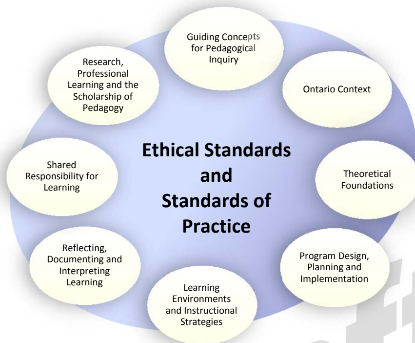
Figure 4: Pedagogical Inquiry Framework for Senior Division, History