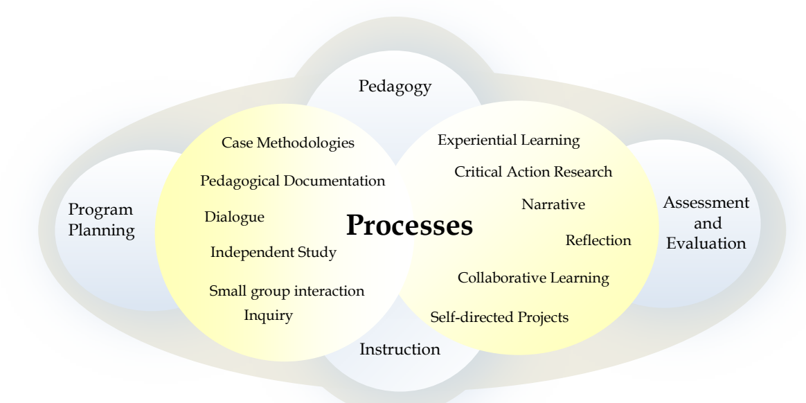
Figure 5: Instructional Processes

In the implementation of this Additional Qualification course, instructors facilitate andragogical processes that are relevant, meaningful and practical to provide candidates with inquiry-based learning experiences related to program design, planning, instruction, pedagogy, integration, and assessment and evaluation. The andragogical processes include but are not limited to: experiential learning, role-play, simulations, journal writing, self-directed projects, independent study, small group interaction, dialogue, action research, inquiry, pedagogical documentation, collaborative learning, narrative, case methodologies and critical reflective praxis.