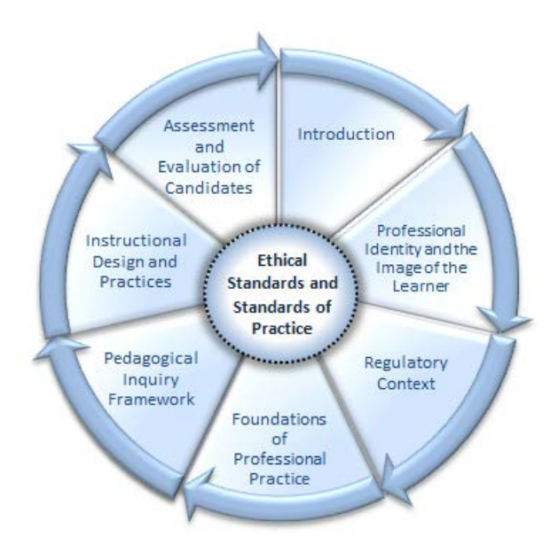
Figure 1: Conceptual Framework

The additional qualification (AQ) guideline Mathematics, Primary and Junior is organized using the following conceptual framework,