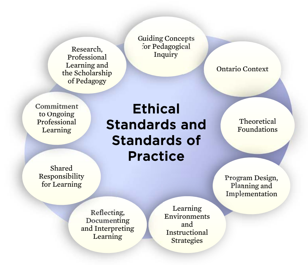
Figure 4: Pedagogical Inquiry Framework for French as a Second Language, Part I