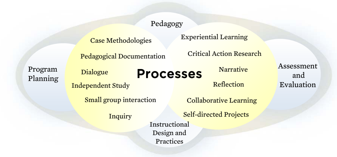
Figure 5: Instructional Processes

Instructors embody the Ethical Standards of the Teaching Profession and the Standards of Practice for the Teaching Profession , honour the principles of adult learning, respect candidates' experience, recognize prior learning, integrate culturally inclusive practices and respond to individual inquiries, interests and needs. Important to the course are opportunities for candidates to create support networks, receive feedback from colleagues and instructors and share their learning with others. Opportunities for professional reading, reflection, dialogue and expression are also integral parts of the course.