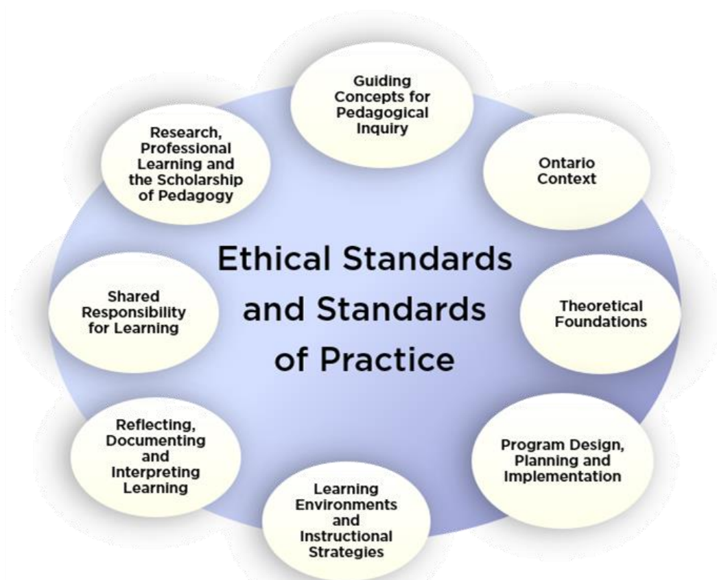
Figure 5: Pedagogical Inquiry Framework for Senior Division, Classical Studies – Greek