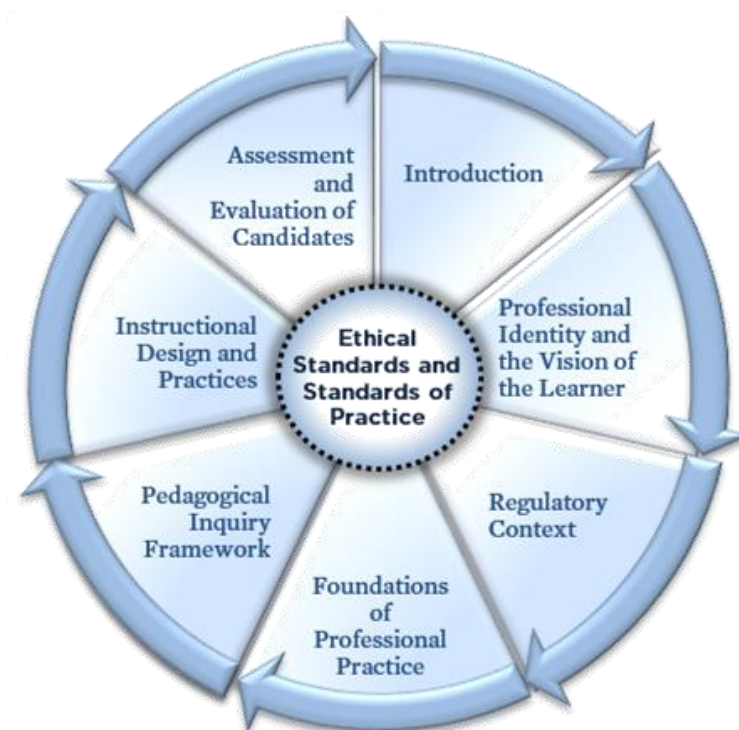
Figure 2: Conceptual Framework

Candidates come to the Additional Qualification Course: Senior Division, Classical Studies – Greek with an interest and/or background in this area of study.