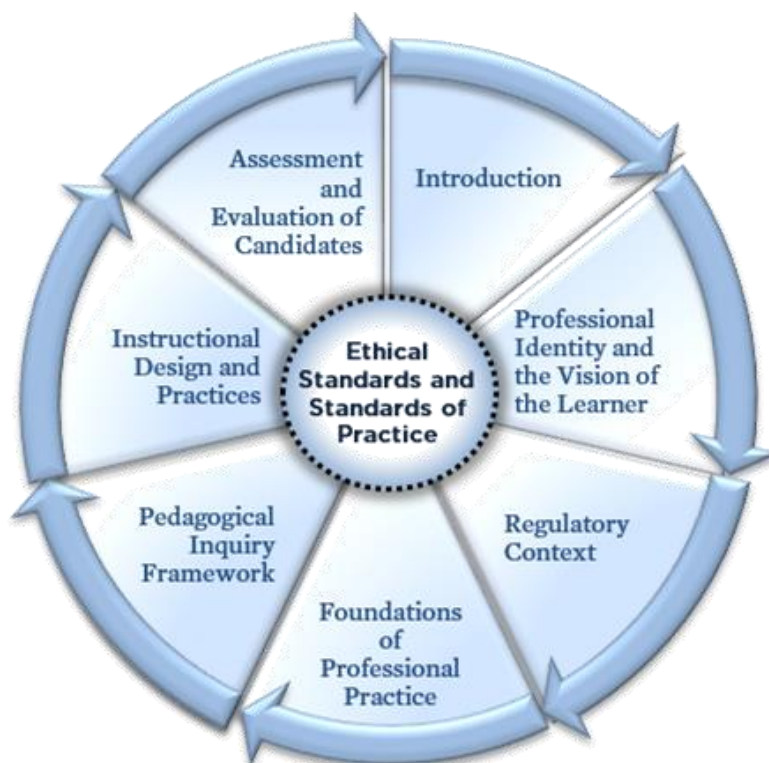
Figure 2: Conceptual Framework

Candidates come to the Additional Qualification Course: Intermediate Division, Science – General with an interest and/or background in this area of study.