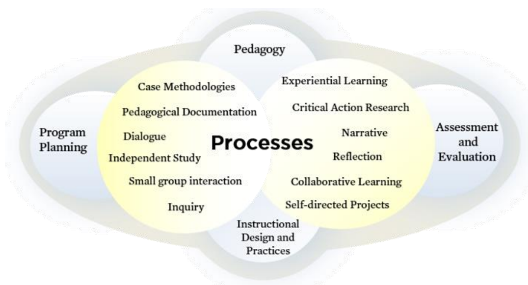
Figure 6: Instructional Processes

In the implementation of this Additional Qualification course, instructors facilitate andragogical processes that are relevant, meaningful and practical to provide candidates with inquiry-based learning experiences related to program design, planning, instruction, pedagogy, integration and assessment and evaluation. The andragogical processes include but are not limited to: experiential learning, role-play, simulations, journal writing, self-directed projects, independent study, small group interaction, dialogue, action research, inquiry, pedagogical documentation, collaborative learning, narrative, case methodologies and critical reflective praxis.